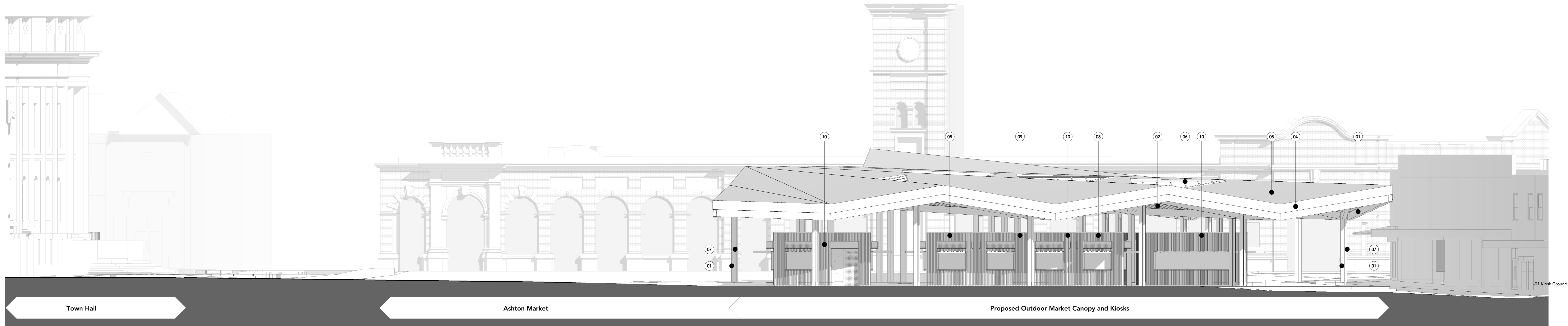
04 Proposed East Elevation 1:100

P02 31.07.2023 Planning Amendment - Canopy Roof levels amended to suit agreed increase in level. P01 JUNE 2023 PLANNING ISSUE Rev Date Info Details © The copyright of this drawing is reserved. This drawing and design is the sole property of Buttress Ltd and must not be reproduced without permission. Buttress Ltd, Manchester, England and Tel: 0161 276 3333